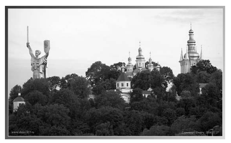
Rodina-mat' and Lavra

people, especially the youth, perceive these messages, and how they can adjust it to the culture of other Ukrainian regions.