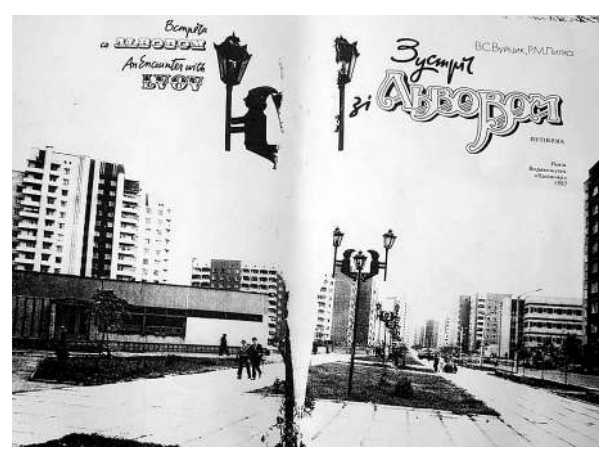
V.Vujcyk, R.Lypka. An Encounter with Lvov. - Lviv, 1987.

The project was glorious. Numerous articles about it were published in local newspapers, informing about the new so called micro districts, schools and shops. It was an ordinary story about Soviet achievements. In 1987 Syhiv was mentioned in the guidebook's story about Lviv (on the guidebook's cover as well as in the article about Soviet architecture<sup>3</sup>).